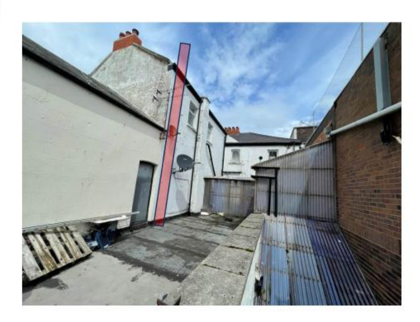
Figure 2: Proposed elevations showing ductwork