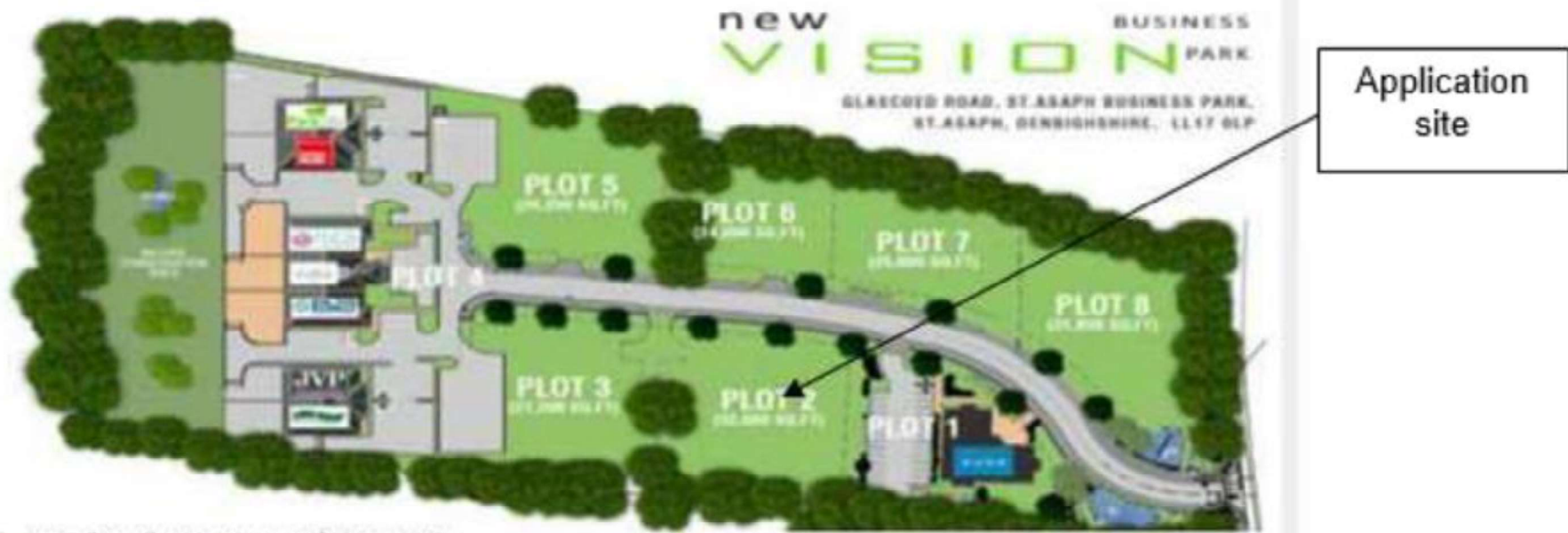
Figure 3: New Vision Business Park Layout