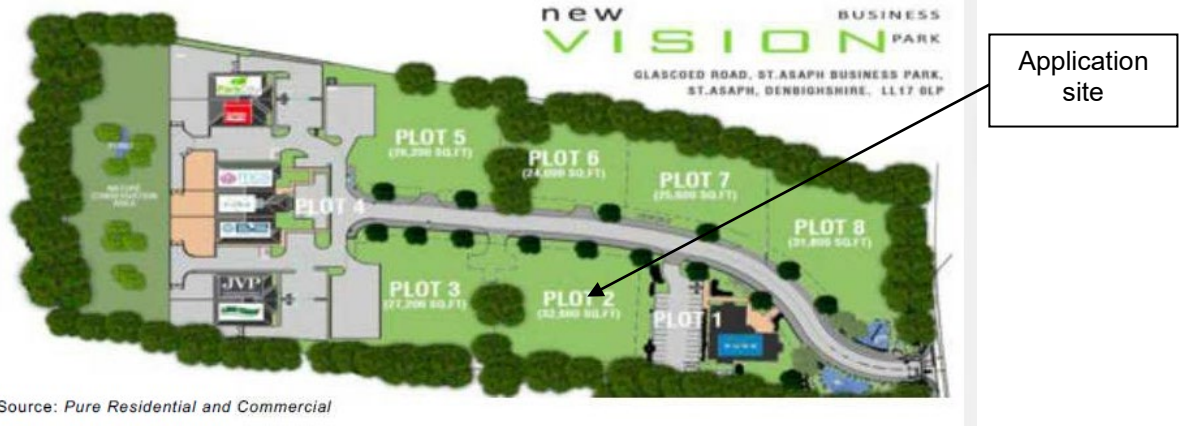
Figure 3: New Vision Business Park Layout