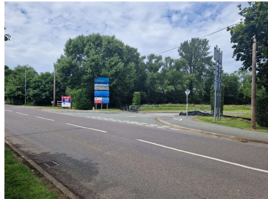
New Vision Business Park Access off Glascoed Road