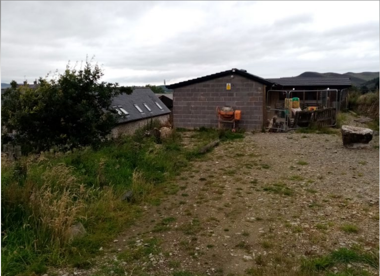
Photo of side elevation of kennels building (Tyddyn Graig is stone house behind)