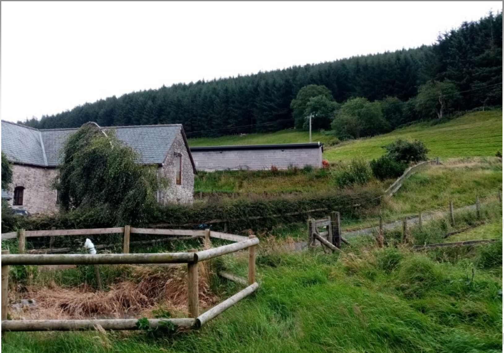
Photo towards the site from Y Graig's garden wall