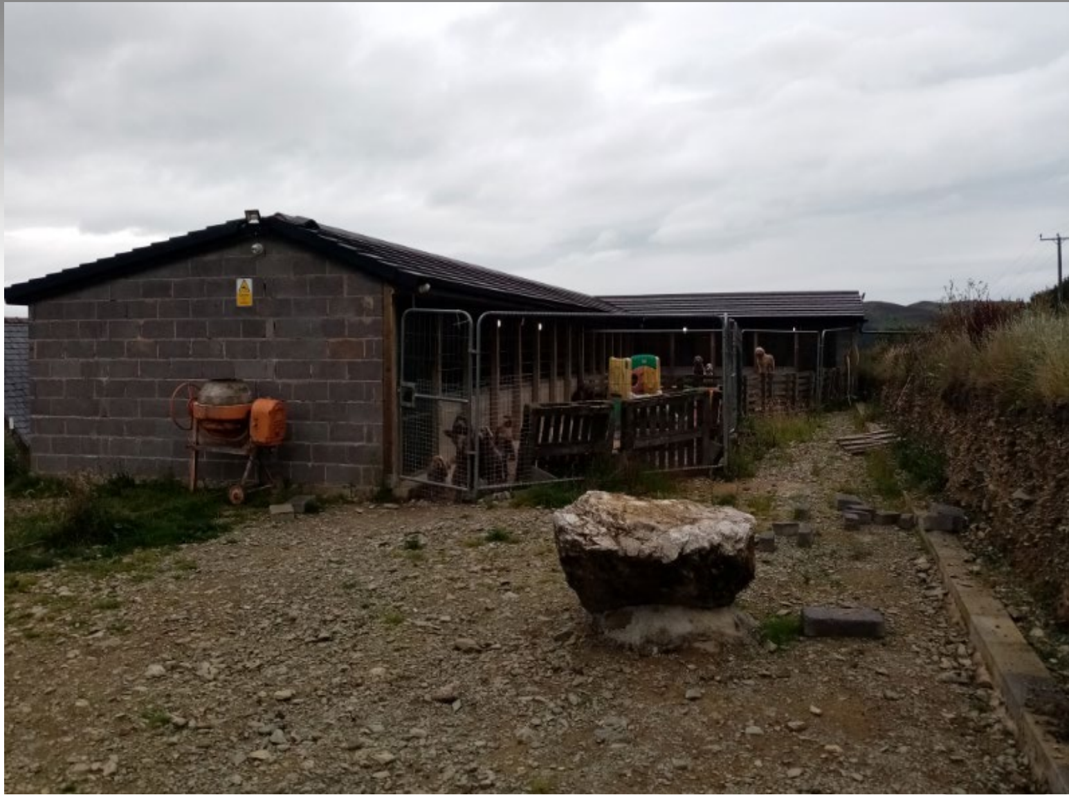
Photo of side and front elevation of kennels building