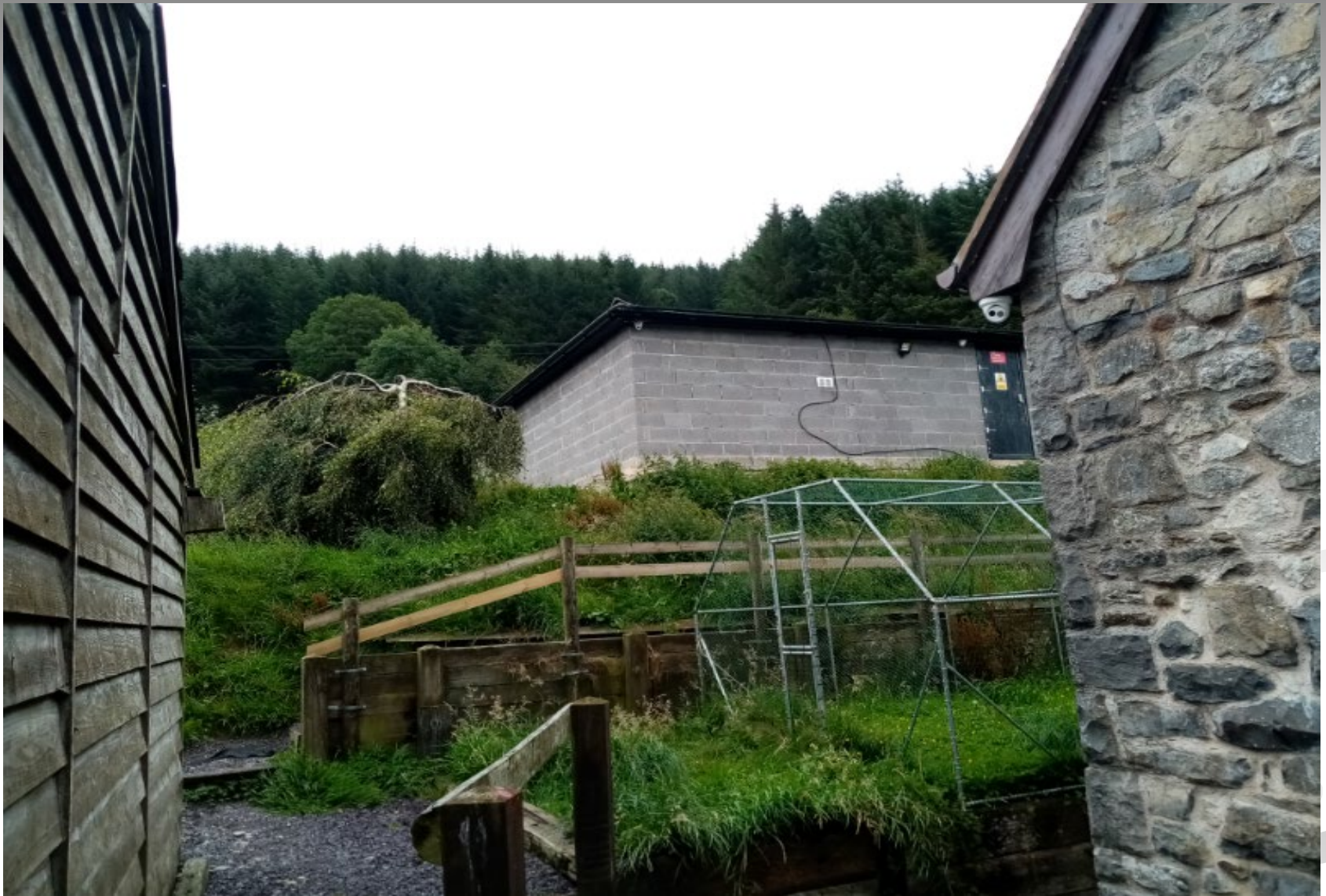
Photo of rear elevation of kennel building from parking area to the side (north) of Tyddan Graig