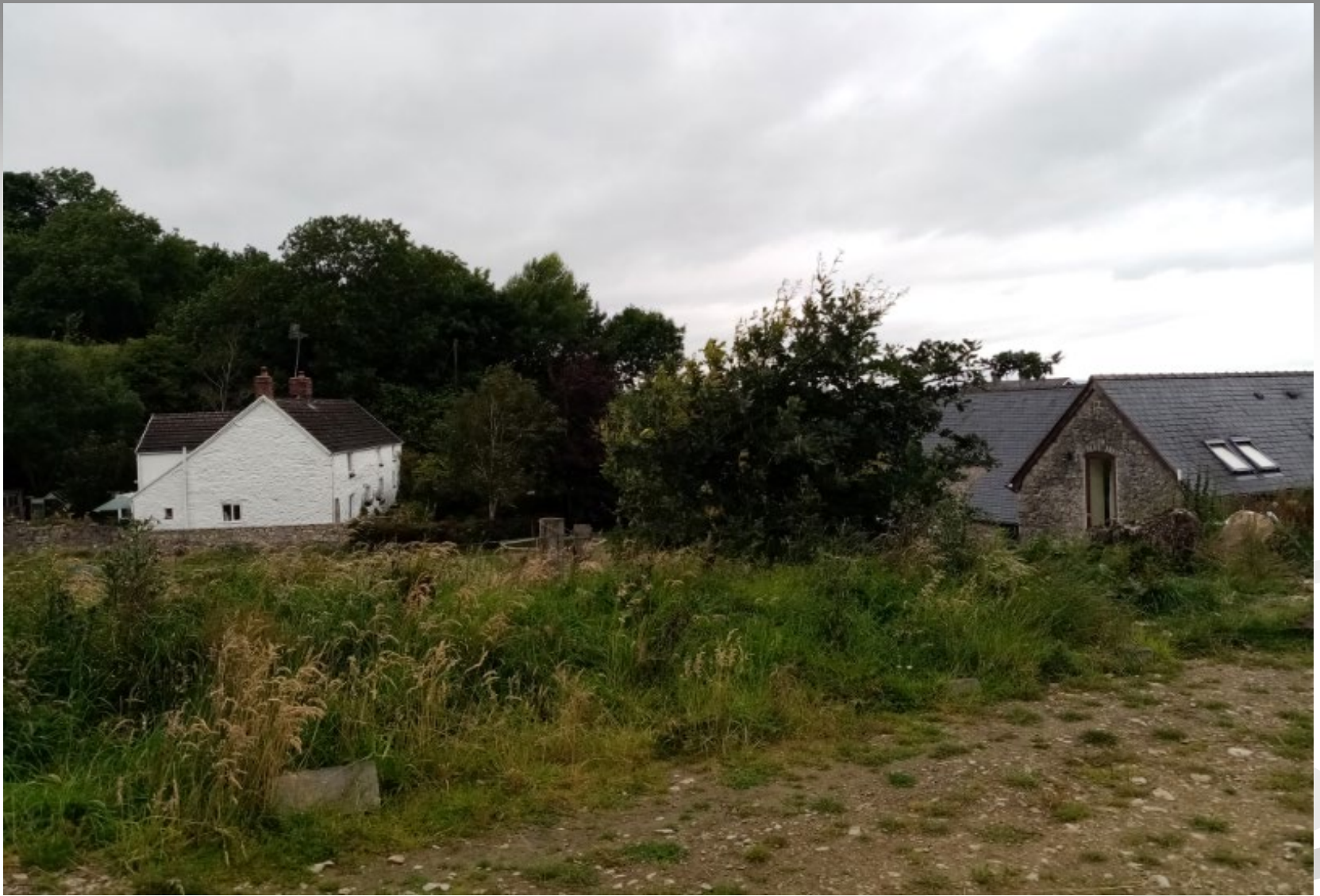
Photo from proposed external exercise area next to kennels building towards Y Graig (whitewash stone house)