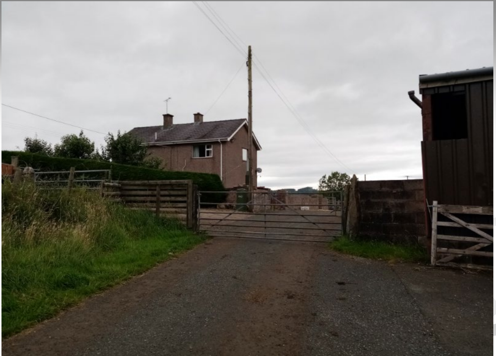
Graig farmhouse (photo taken from Tyddyn Graig driveway)