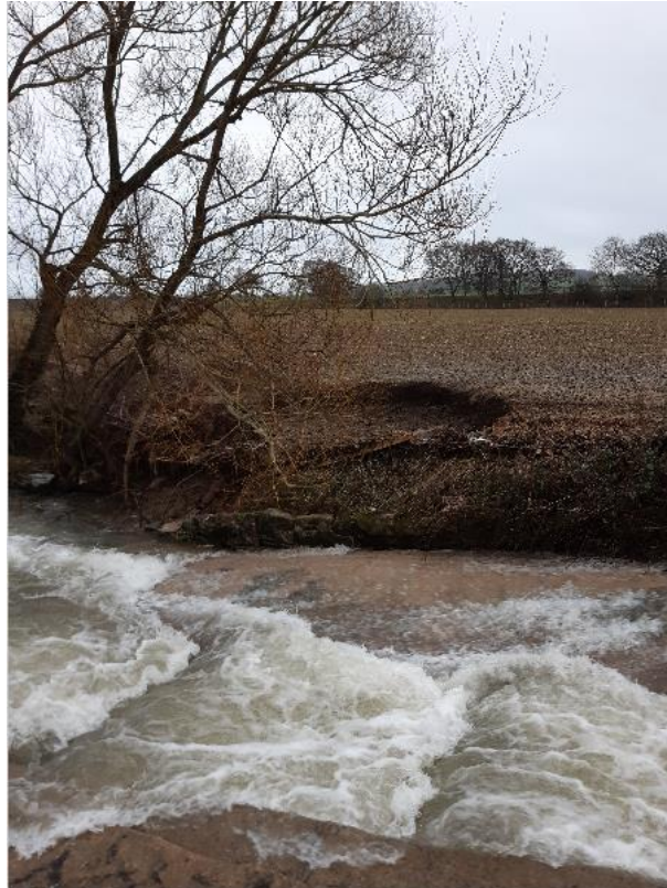
Image 3. Area of scour on right bank adjacent to weir.