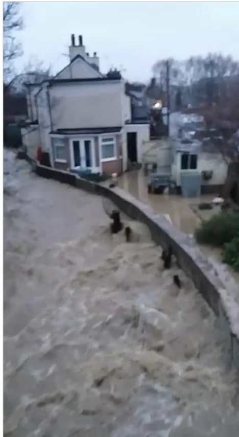
Image 1. Extract from local residents' video at the approximate peak river level.