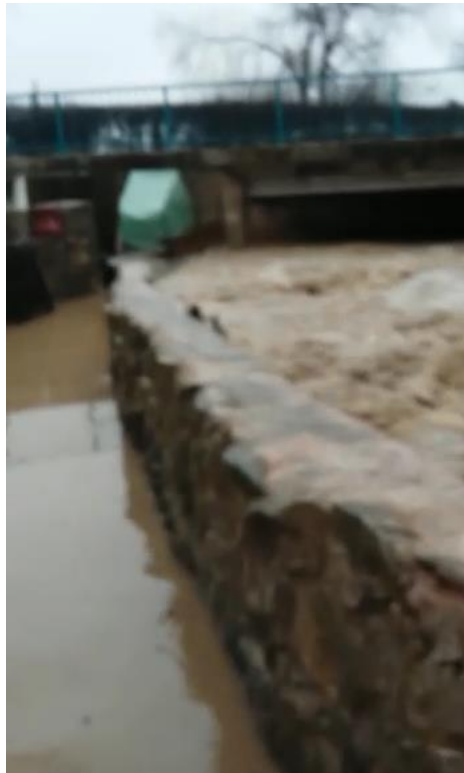
Image 2. Extract from local residents' video showing water levels across the wall at the downstream end at the approximate peak river level.